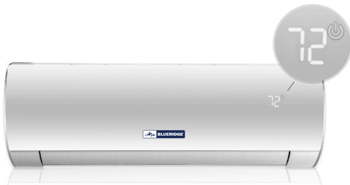
INDOOR UNIT FRONT PANEL DISPLAY: Look here for LED display of system status, setpoint and indoor temperatures and malfunction codes.