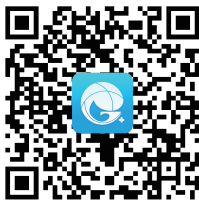
GREE+ App Download Linkage

Scan the QR code or search "GREE+" in the application market to download and install it. When "GREE+" App is installed, register the account and add the device to achieve long-distance control and LAN control of Gree smart home appliances. The "GREE+" App can connect an unlimited number of Gree WiFi enabled products. For more information, please refer to "Help" in App.